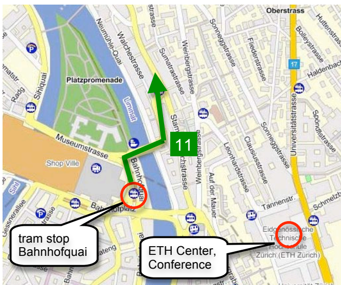
area around Zurich main station

From ETH Center it is best to go to the tram stop "Bahnhofquai" between the main station and the Limmat river. You can either walk, take a tram, or ride the cable car. There you board a tram no. 11 in direction "Auzelg" . In the evening, trams run every 7 to 8 minutes; after 13 minutes you arrive at the tram stop "Regensbergbrücke" ; here you get off. Cross the bridge over the train tracks and take the first left. After about 100 meters you will have an old foundry to your left - and that's the place!