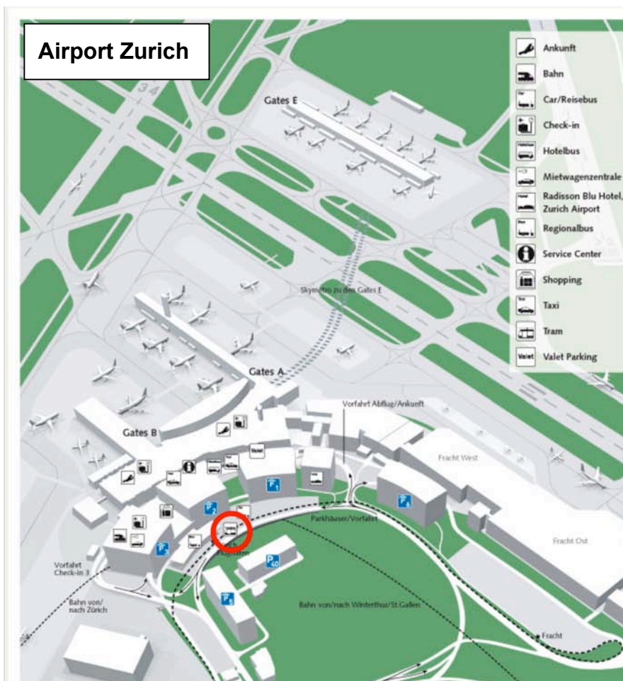
red circle: tram stop airport

Note: Around ETH center, there are only metered short-term parking spaces. If you come by car you will have to leave it either at your hotel or park it in a public parking lot. Use the city-wide carpark guiding system.